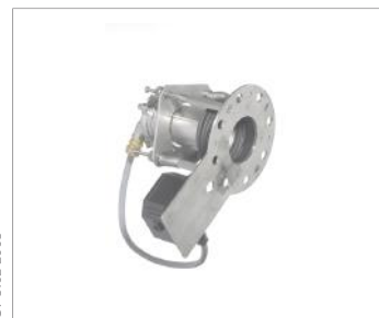
Dräger Pulsar 7000 Heavy Duty