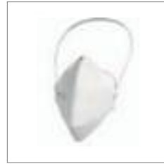
Dräger X-plore 1730