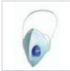
Dräger X-plore 1720 V