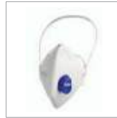
Dräger X-plore 1730 V