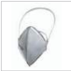
Dräger X-plore 1710 Odour