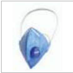
Dräger X-plore 1710 V