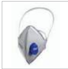
Dräger X-plore 1720 V Odour