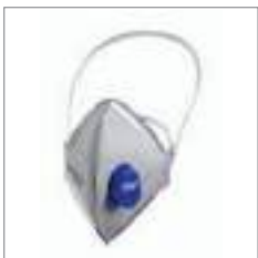
Dräger X-plore 1710 V Odour