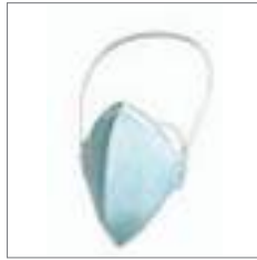
Dräger X-plore 1720