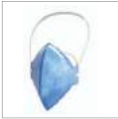
Dräger X-plore 1710