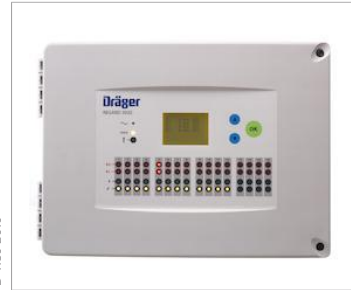
Dräger REGARD® 3910